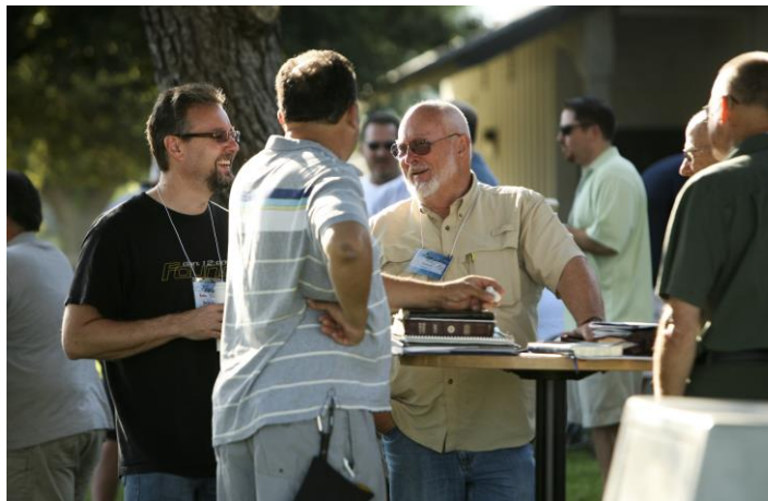
Men being challenged to disciple one another.

Second , Christian character. I learned that I need to help people leave behind the divided life . In a divided life, which is all too common, people have two ways of living: their church life and their personal life. On one hand, you are committed to the riches and glories of Christ, and on the other you are committed to the desires of the world. But, in order for you to make an impact on people for the sake of the Gospel, you need to see Christ as your ultimate joy, and be utterly intentional about removing sin from your own life. Warring against the hypocrisy of a “divided life” is a fight of faith; it’s at the heart of true character-building for the sake of His Kingdom (Rom 8:12-13).