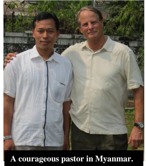
A courageous pastor in Myanmar.