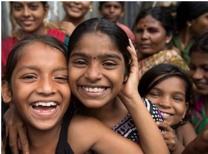
Some of the faces we see in India that tug at our hearts.

In summary GFL has shown me that my church needs to replace the American dream with the cross of Christ. For, only in this way will our members be equipped with Christ-like character, rock-solid convictions, and a proactive desire to equip one another for service and maturity. With GFL's contagious vision, and practical equipping, I am confident that the training I have received is impacting the lives touched by my ministry and will bear fruit for years to come.