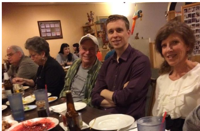
Birthday dinner with friends of Gospel for Life.

First , Biblical conviction: this was my biggest blind spot. I understood the importance of having my own convictions, but, I was not sure how to go about training other people in their convictions. GFL showed me how to think about the process of helping people remove the obstacles that hold back their sanctification. And in tandem with this, the necessity of equipping people in systematic theology. This step scares the average congregant at my church. But, after working with GFL, I could see that this was the missing link. The priority became clear; Christians need to have Biblical convictions that they are able to communicate, as well as have those convictions pour forth from the way they live.