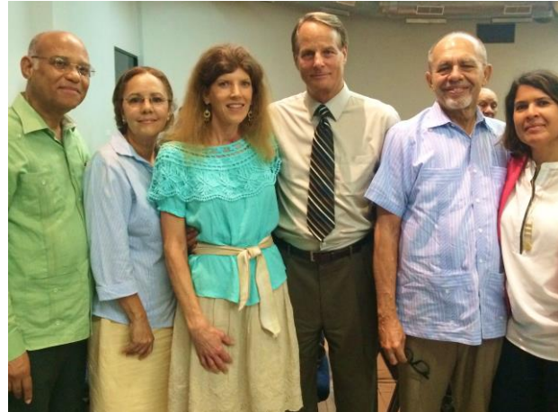
Discipleship equipping in Santo Domingo, D.R.

3.) Biblical worldview studies. The advantages of reading books on biblical worldview are: 1) We learn to see the big picture (God's 'master plan'). In our age of fragmented knowledge, the unity of all things under the lordship of Christ is essential in order to have a joyful, unified Christian experience. 2) Biblical worldview gives us the biblical categories of thought by which to apply discernment to all areas of our culture.