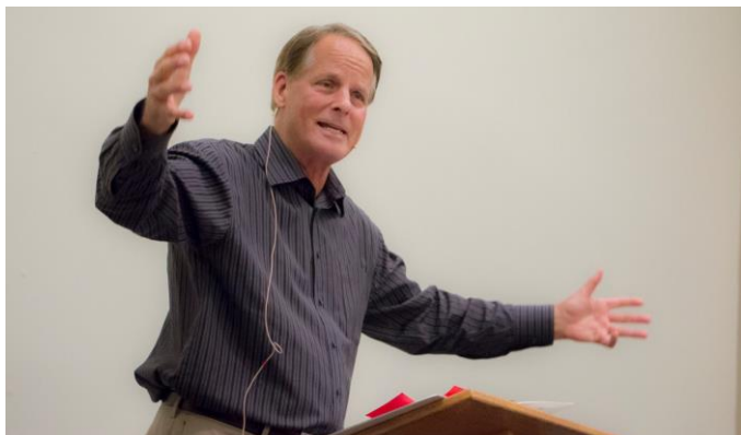
Thankful for new opportunities to invest in disciple-makers.

2.) Bible study method. Hands-on hermeneutics (Bible interpretation) involves showing the disciple how to arrive at the meaning of the text. Gaining capacity in the steps of interpretation is essential in order for the disciple to learn to feed himself from the Word. Also, as the disciple learns this 'inductive Bible study method' he will gain the ability to prepare his own lesson plans/sermons.