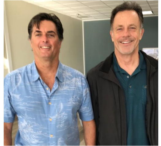
Brothers who are growing disciple-makers.

The Seven Essentials above are foundational. But, if the mentor finds himself working with more mature disciples, he is encouraged to consider going beyond the seven essentials into other areas of training. Additional areas include: Christian apologetics, biblical languages, historical theology, biblical counseling, church history, homiletics, etc.