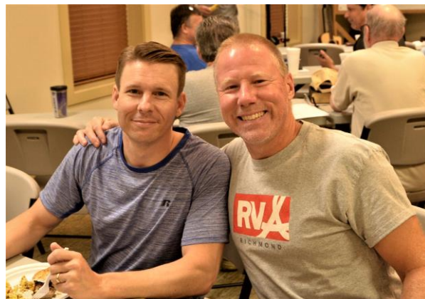
Men's retreats are a prime venue for training in spiritual warfare.

Maturing believers play a vital role in training growing believers in the spiritual disciplines necessary for stability. Disciple-making is a kind of spiritual boot camp —it has rightly been said, the more you sweat in training, the less you will bleed in battle . At Gospel for Life, we train disciples to wield the spiritual weapons which God has provided ( 2 Cor 10:3-5; Eph 6:10-20 ).