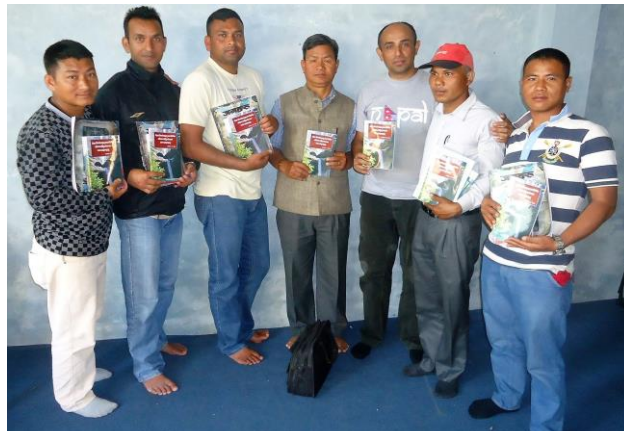
Military men in Nepal with GFL's book of Christian theology.

Gospel promises are therefore mighty because God's attributes stand behind them, and by these gospel promises true believers are assured that they have escaped the corruption that is in the world by lust (2 Pet 1:4).