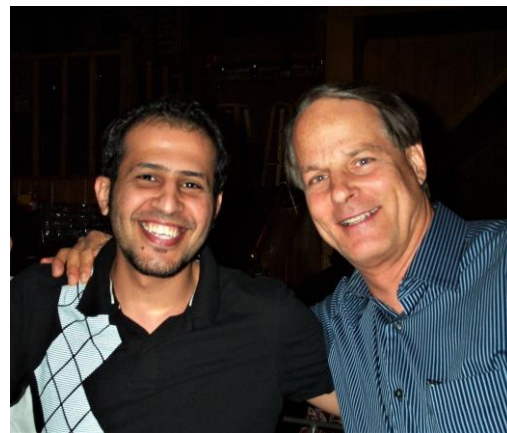
The tens of thousands of foreign students in America represent a massive mission field.

In view of these truths above, it is our endeavor at GFL to equip men in order to see them set free, empowered, and released to ministry.