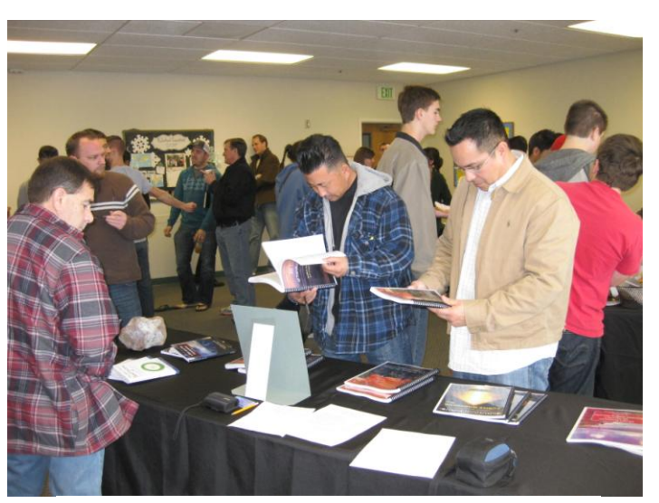
World-proof attendees check-out GFL resources

High school grads think they are spiritually prepared for their secular college experience but most are not. Once in university they find that they are unable to mount a theological defense of biblical worldview. The majority discover too late that their faith is not ready for the daily assault of pagan ideas. In addition, their hunger for validation keeps them from being willing to suffer misunderstanding for the sake of Christ. Whether parent or student, you can take steps to be further equipped—the world-proofing audio link is: http://gospelforlife.org/audio/2013/2/11/exposingthe-lies-of-our-public-universities GFL