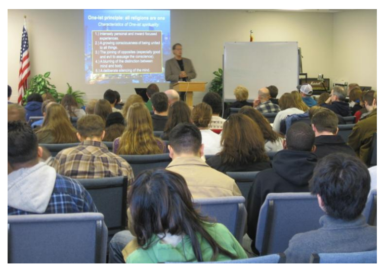
A time of intense training at the World-proofing workshop

3. ) "Tolerance demands moral relativism in the interest of unity and fairness."