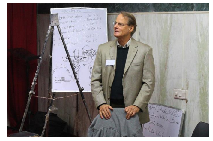
Illustrations help to bridge the cross-cultural gap (Delhi)

One Pastor said, "The urgent need of our church is discipleship. This is the reason I strongly encouraged our elders to go to the USA to attend GFL's training. I especially appreciate the way you modeled the disciple's dependence upon God by emphasizing prayer in your lectures, (cont. on back pg.)