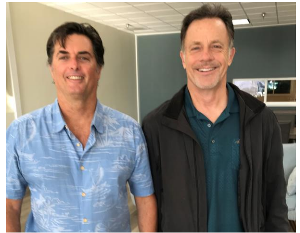
Men eager to grow are an example to other men.