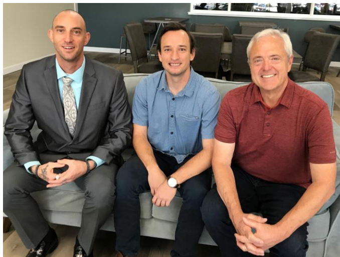
Some of the men in our disciple-making group.

2) The second aspect of discipleship emphasizes the fact that the believer is not done with the cross once he begins the Christian life.