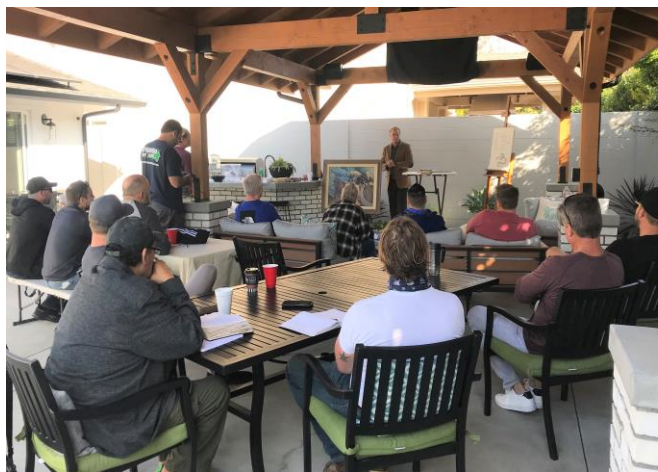
Spiritual growth seminar this month in Los Alamitos, CA. "How Convictions become Christian Character."

Dedicated men are coming out on Saturday mornings in order to be accountable to one another and to grow spiritually. In addition, at a recent GFL men's seminar this month, a number of spiritual needs came to the surface. I'll share these needs in the form of questions asked by the men: