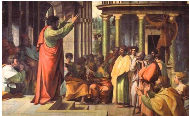
Raphael's "Paul in Athens"

“But he who is spiritual appraises all things, yet he himself is appraised by no one. For who has known the mind of the Lord, that he will instruct Him? But we have the mind of Christ” (1 Cor 2:15-16).