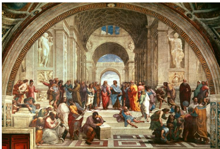
Raphael's "School of Athens"